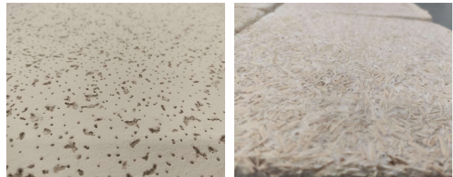
a) Conventional mineral fiber-based acoustic ceiling tile