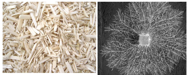
a) Residual hemp fibers

whole bagged hemp fibers, resulting to firmly joined interwoven 3-dimensional filamentous network. To form mycelium based composite panels, the inoculated substrate is set in a 210 x 210 x 15 mm 3 mold and put back into the incubation chamber for another week. Finally, the square panel is unmolded and placed in an oven at 90°C for, at least, 4 h to stop fungi mycelium growth.